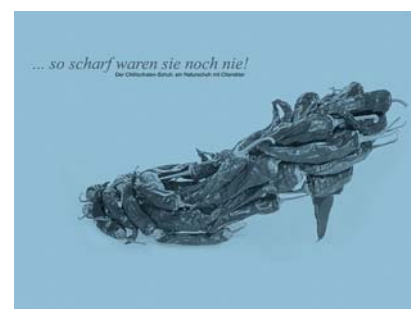
Shoe Stories (Internet)

To a large extent the grounds for taking part in the [mla] and the benefits of doing so overlap. In sum, a central aspect for participation, reported by about 50 per cent, is the recognition and the possibility of presenting media projects outside the school. For about 40 per cent