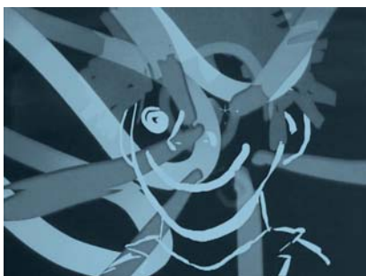
Show me the way to the next whiskey bar ... (Animated film)