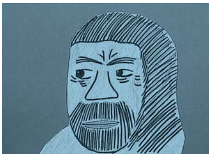
Homo sapiens Prize-winner 2007, Video

Since the members of the group of those asked are regarded as opinion leaders, the suggestions and wishes they articulate for future media work in schools are particularly interesting. On the one hand the teachers' answers refer to the organisational aspects of school media work and, on the other to the contents. Thus they demand better technical and financial resources, more time, and more further training possibilities in the