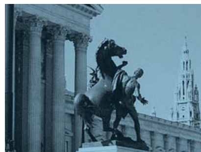
NationalratsQual [National Election Torment] 2008 (Feature) Prize-winner 2008, Radio