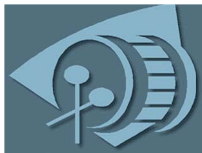
The Media Around Us

There is a tendency for teachers who participated in the [mla] to have a high level of theoretical knowledge. Numerous aspects which are fundamental to the concept of media literacy are regarded by the teachers as essen-