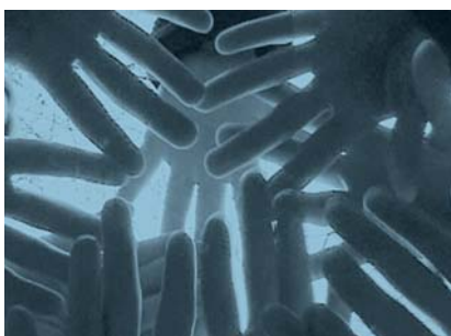
L.E.B.E. (Street Interviews) Prize-winner 2007, Video