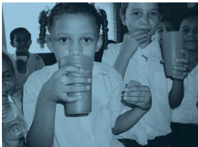
School Breakfast for Nicaragua (Radio report)