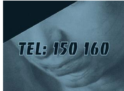
Re/artions (Art Project/ Website) Prize-winner 2008, New Media

Contribution published by www.mediamanual.at on 8. October 2010