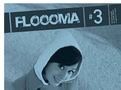
Flooma – school magazine with online edition